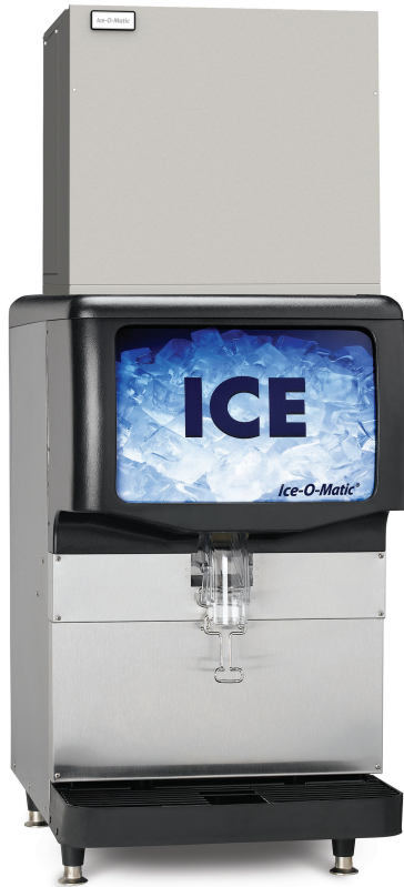
GEM2006 ON IOD25 ○